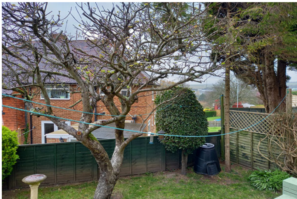
Fig 2: view from 87 Fernhurst Crescent

The view from 87 Fernhurst Crescent clearly shows that the new extension would not only completely obscure their outlook of the South Downs, an important feature and a portion of the value of houses in this part of Brighton, but would also mean their house was overlooked by a number of new windows.