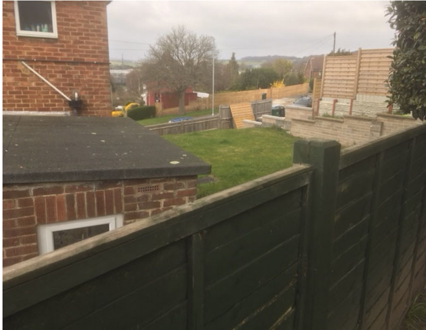
Fig 4.: view from garden level of 87 Fernhurst Crescent

Second, the planning statement states on page 4: