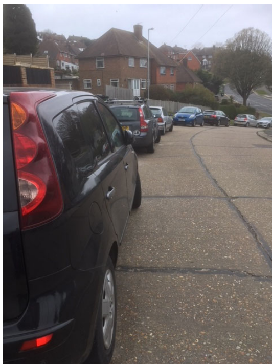
Fig. 7: parking on Keymer Road

Parking is a very serious concern in this area. Importantly, recent developments in Patcham & Hollingbury Ward have been approved only after they included significant increase in off-road parking, for example BH2020/01860 2 Winfield Avenue Brighton BN1 8QH, which now provides six off-road parking places for four houses when the previous plan for that site was for two parking places for five houses. There is no reason why this application should also not be required to supply off-road parking.