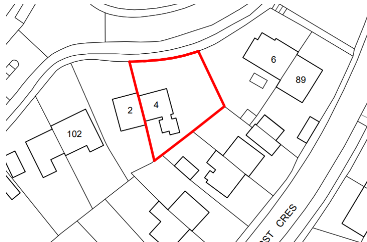
Fig. 1: plan of current dwelling at 4 Keymer Road (p.2 in Planning Statement)

According to the plan in Figure 1 below, there seems ample space between the properties.