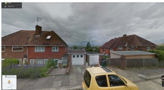
Street view of the gap between 89 and 87 Fernhurst cres showing the distant perspective view.

Seven, the planning statement claims that the proposed development would not affect the views from neighbouring properties. However, the photo used (see Fig. 10 below) is taken not from the actual view from the residents’ houses, but from a significant height above parked vehicles, giving a very inaccurate portrayal of the significant visual harm the extension would cause.