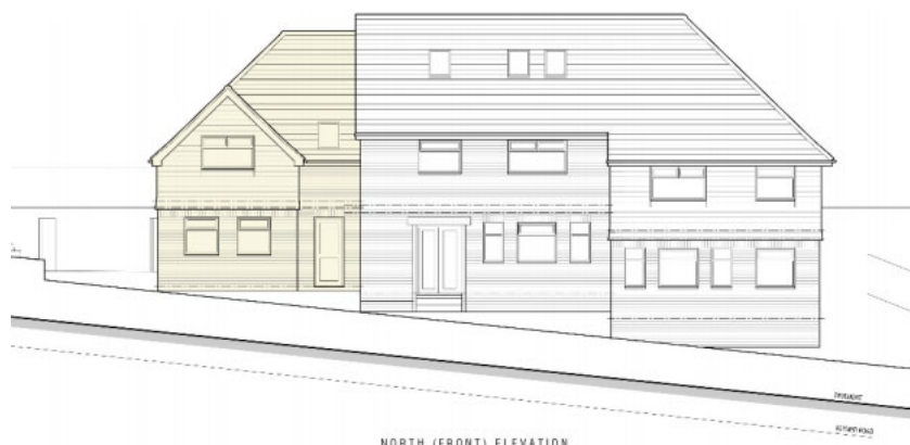
Fig. 6: plans of extension from Keymer Road

The design given in the Planning Statement (see Fig. 6) does not accurately portray the impact of the house and extension from pavement level. Most dwellings in this area are semi-detached; this would be a terraced house of considerable bulk looking down onto the pavement. The view from Figure 6 is straight-on, and thus misleading.