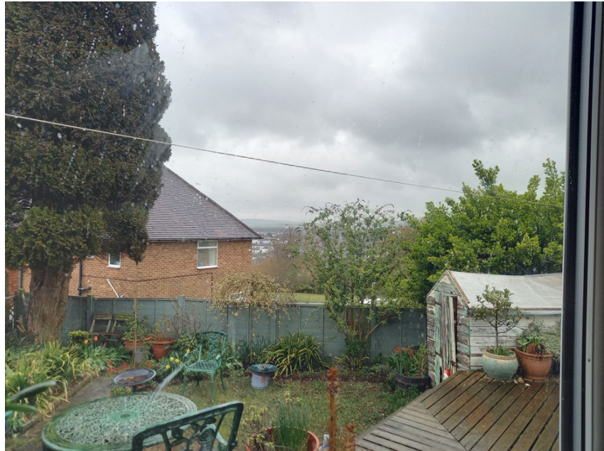
Fig. 3: view from 87 Fernhurst Crescent

Figure 3 below shows that the view from 89 Fernhurst Crescent would also be completely lost. The washing line provides a useful guide for the potential roofline. Instead of having a very open and light aspect, key reasons for the resident acquiring this property, it would become overlooked and shaded.