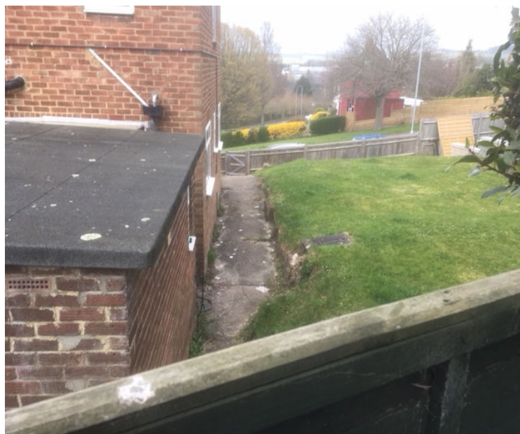
Fig. 8: the garden of 4 Keymer Road, exhibiting no enthusiasm for biodiversity

This biodiversity statement seems at odds with the significant reduction in the size of the garden, which surely affects the biodiversity of the area. The current owner has done nothing to enhance the biodiversity of the property (see Fig. 8), so there is nothing to suggest any of these biodiversity plans would actually be implemented, and equally important, maintained. This house is after all being rented out, so any maintenance would be the concern of renters.