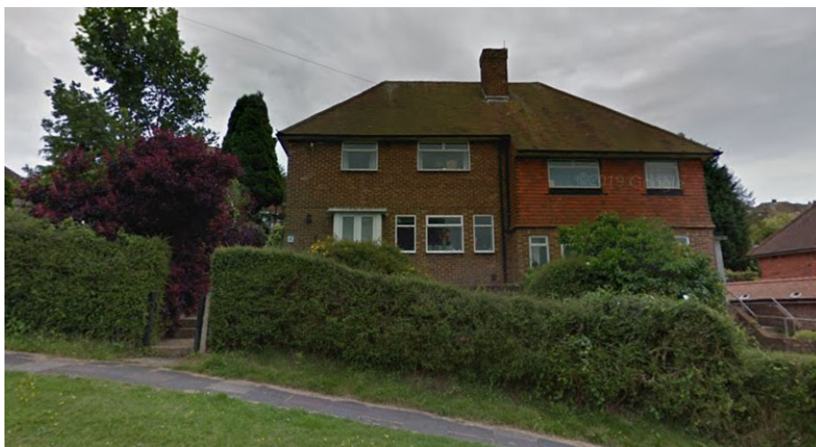
Fig. 5: view of Keymer Road from pavement level.

As can be seen from Fig 5 below, from pavement level, because the current property, 2 and 4 Keymer Road, are significantly higher than pavement level, the facade is very imposing and bulky. The extension, turning the property into a terrace, will only make it more so.