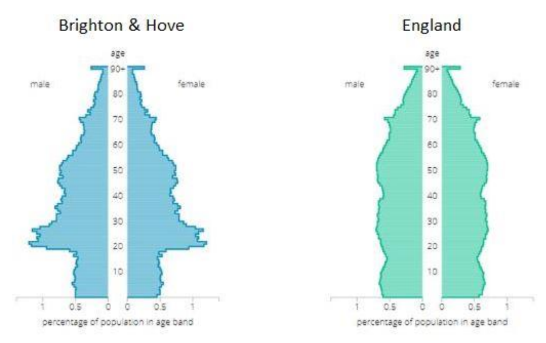
Figure 1. Population age profile in Brighton and Hove: 2017