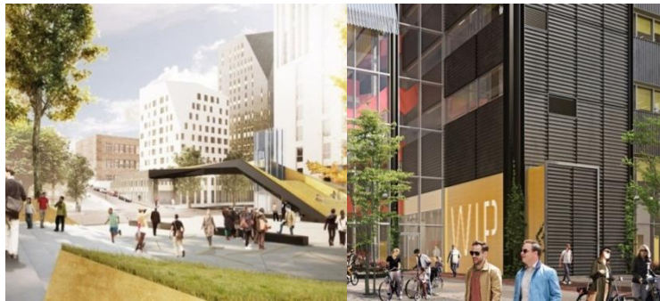
The proposed scheme