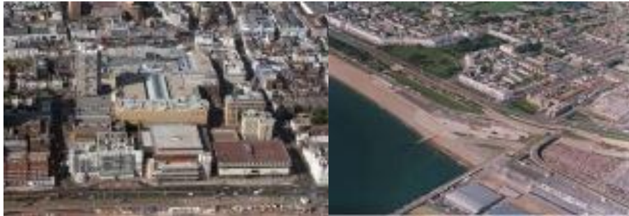
The Brighton Centre and Churchill Square Black Rock