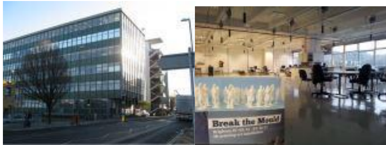
New England House