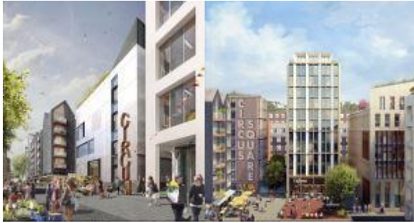
The scheme designs